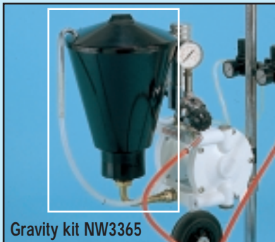
Gravity kit NW3365

NW3405 NOREXCO® double diaphragm pumps 1:1 - 24 ltrs/min. are available in many versions. Consult your nearest dealer for further information.